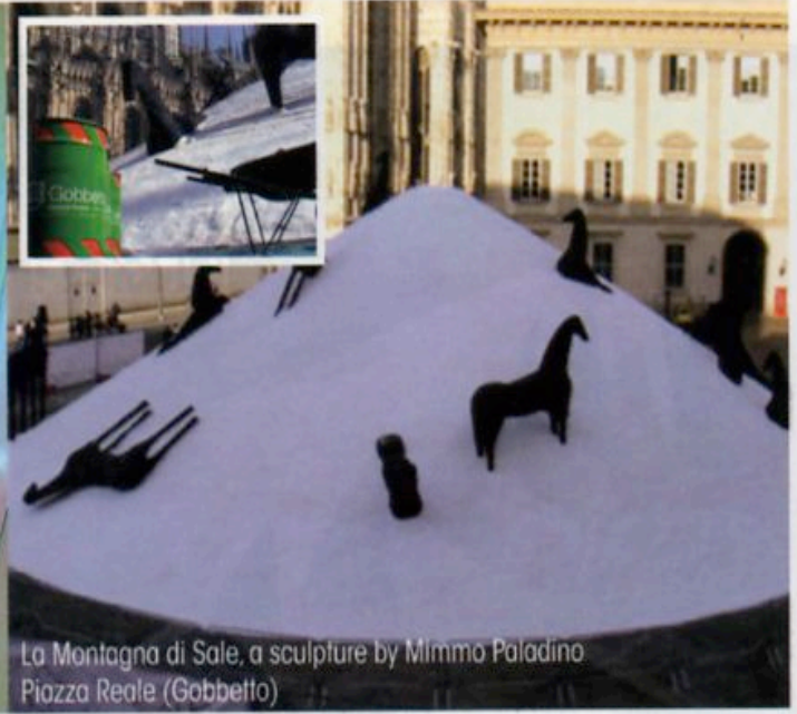
La Montagna di Sale, a sculpture by Mimmo Paladino Piazza Reale (Gobbetto)