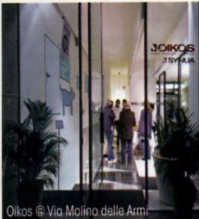
Oikos @ Via Molino delle Armi Brandoni @ Good Design Gallery