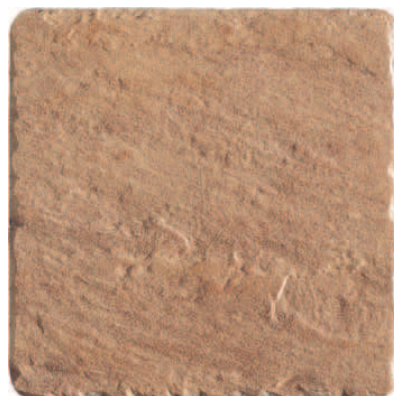
CHIOSTRI UMBRI SPELLO