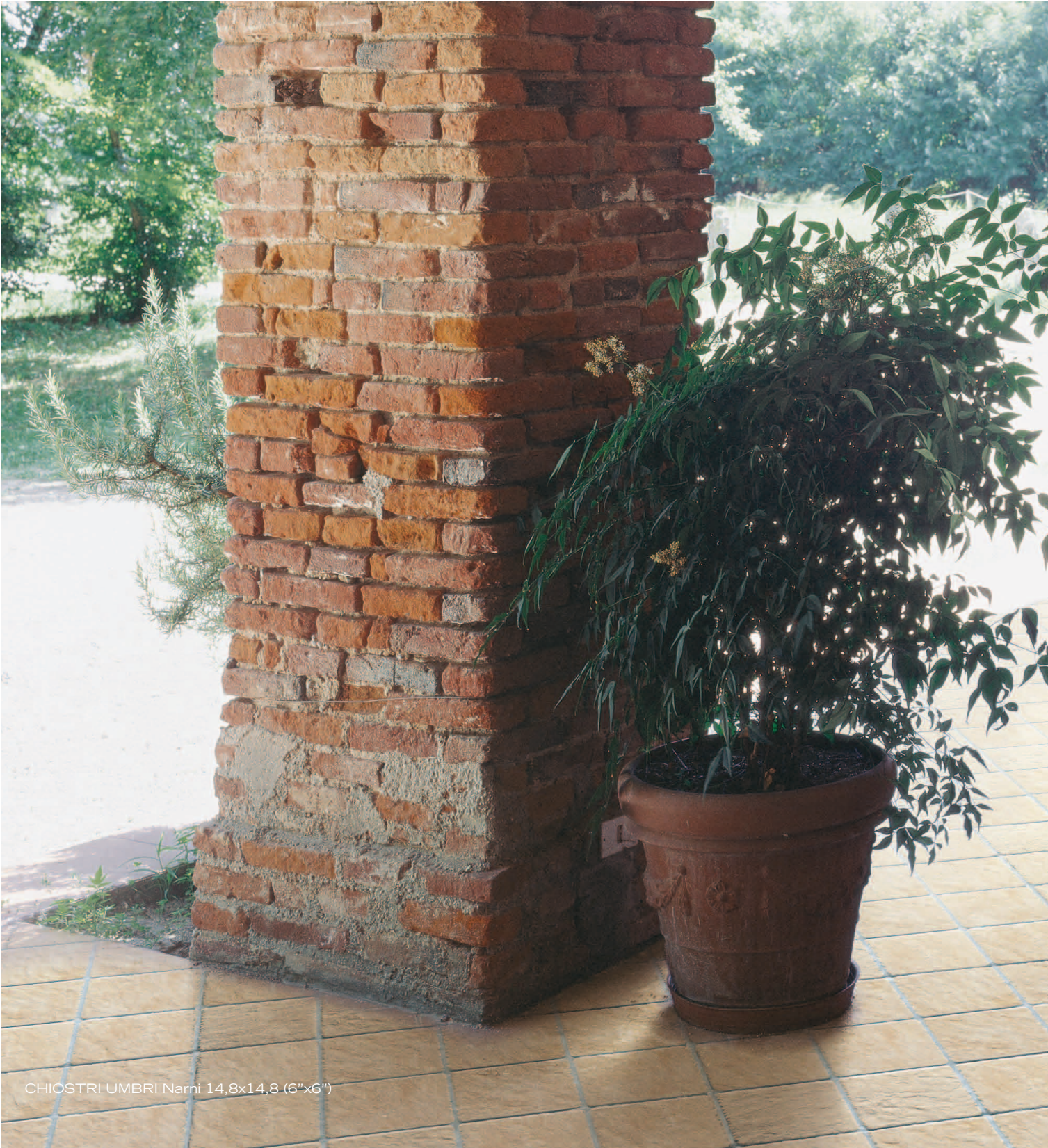
CHIOSTRI UMBRI Narni 14,8x14,8 (6"x6")