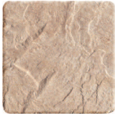
CHIOSTRI UMBRI CAMALDOLI