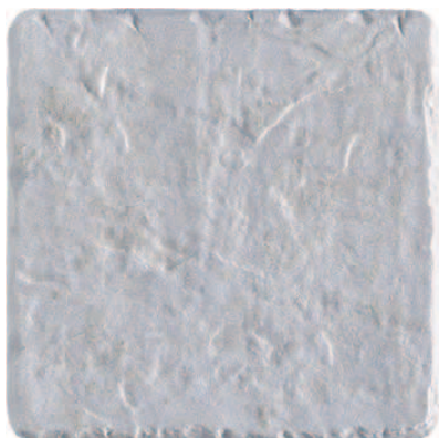
CHIOSTRI UMBRI TREVI