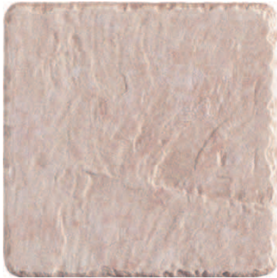
CHIOSTRI UMBRI NORCIA