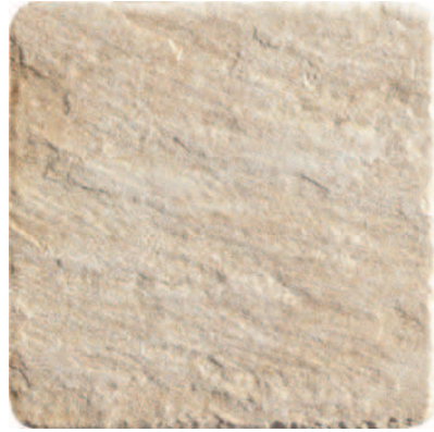
CHIOSTRI UMBRI NARNI